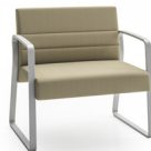
Bariatric Sled Base | WF1431