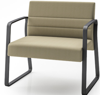
Bariatric 750lb capacity