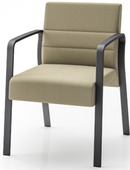
Guest 400lb capacity