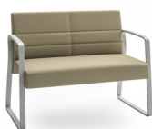
Loveseat Sled Base | WF1531