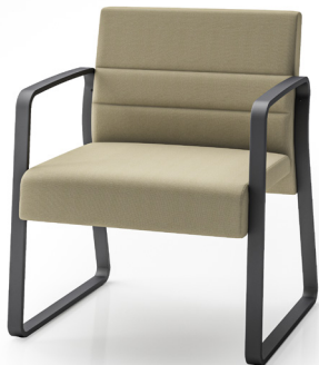
Oversize 500lb capacity