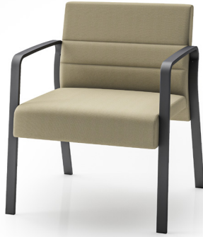
Oversize 500lb capacity