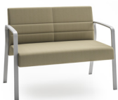
Loveseat Leg Base | WF1501