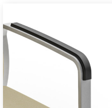
PU Arm pads