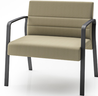
Bariatric 750lb capacity