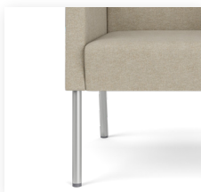
Heavy Duty Steel Leg