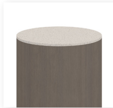
Table Detail Solid Surface Option