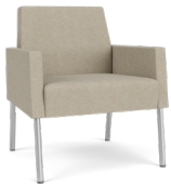
Guest Chair ML1101