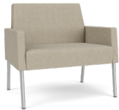
Bariatric Chair ML1401